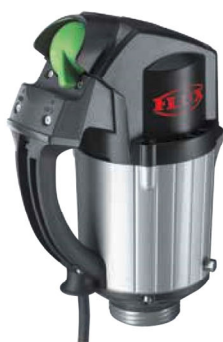
F 460 Ex (HT)

Both our motor F 460 Ex (HT), as well as our 400 series explosion proof (HT) stainless steel pumps are certified by the National Metrology Institute (PTB) for applications in hazardous areas with higher ambient temperature of up to 60 °C.